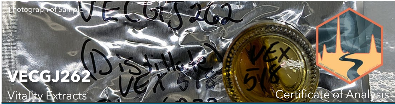
Photograph of Sample